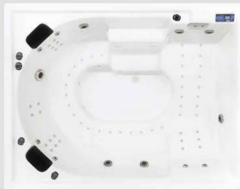
JUMBO (2400 X 1900 X 860)