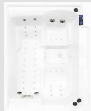
CARIBBEAN (2000 X 1600 X 770)