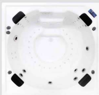
PACIFIC (2000 X 1900 X 770/860)