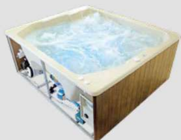
LUXURY MODEL 3 MOTOR SYSTEMS (SILENT HEATING)

Traditional shapes, affordable, efficient features