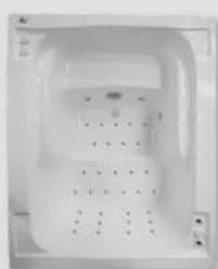
BUDDY 1480 X 1850 X 775