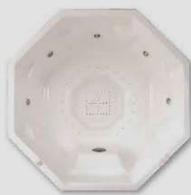
BARACUDA 1900 X 2000 X 770