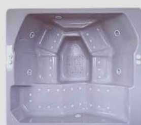
MANTARAY 1900 X 2000 X 770