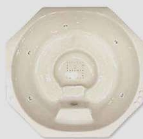
SEA HORSE 1900 X 2000 X 770