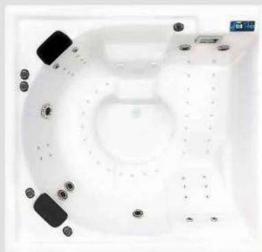
ATLANTIC (2000 X 1900 X 770/860)